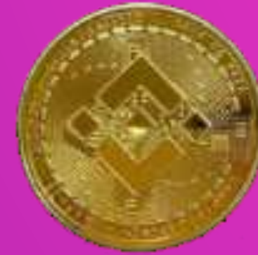
Binance Coin (BNB)